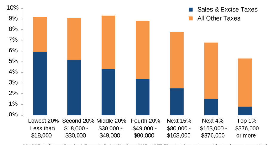
FIGURE 2: Lower income taxpayers pay greater share of income in sales taxes compared to higher income taxpayers

NOTE: The chart does not account for tax changes passed by the NC General Assembly in 2015.