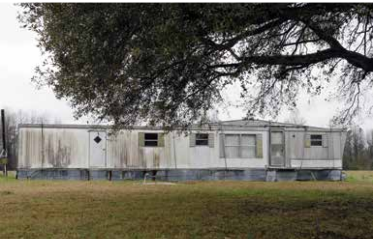
Trailers or mobile homes where workers often live are less resistant to storms and flooding.

Many workers do not speak English and it can be difficult to access important information about the location and severity of a disaster in languages workers speak. 12 Accessing information from government agencies or news alerts can be difficult without access to the internet