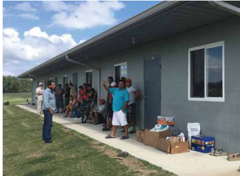
Episcopal Farmworker Ministry visits farm workers.

on how to prepare for floods, hurricanes, wildfires in Spanish on their website. (Appendix 3)