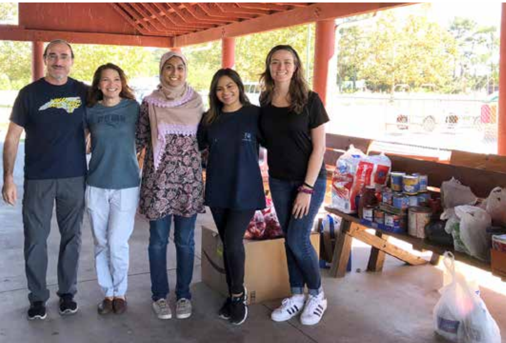
Episcopal Farmworker Ministry staff and Student Action with Farmworkers students packing supplies for farmworkers affected by Hurricane Florence.

An organization shared a link to an Amazon.com shopping "wish list" via social media and email to publicize the specific donated goods and materials that they needed and make it easy for donors to purchase and send the goods and materials. One organization successfully hosted a hurricane relief event to collect donations for specific farmworker needs from the community. One organization received a larger emergency disaster relief grant that allowed them not only to serve farmworkers affected by the hurricane in their smaller service area but also to partner with "on the ground" advocates in other devastated counties to distribute food and supplies to affected farmworkers. Multiple advocates working in the other devastated counties remarked how this partner collaboration was crucial to their relief and recovery effort.