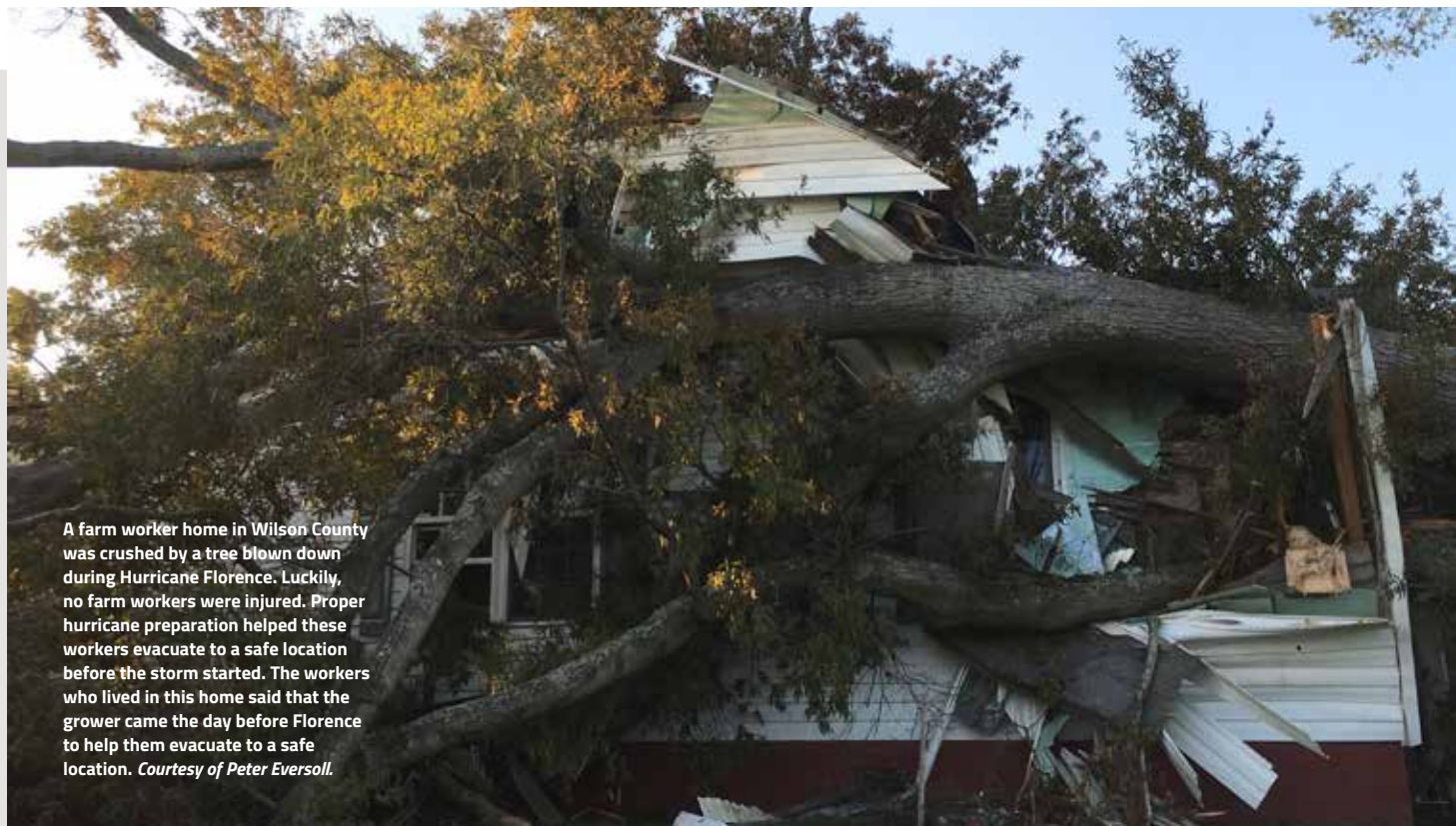
A farm worker home in Wilson County was crushed by a tree blown down during Hurricane Florence. Luckily, no farm workers were injured. Proper hurricane preparation helped these workers evacuate to a safe location before the storm started. The workers who lived in this home said that the grower came the day before Florence to help them evacuate to a safe location.