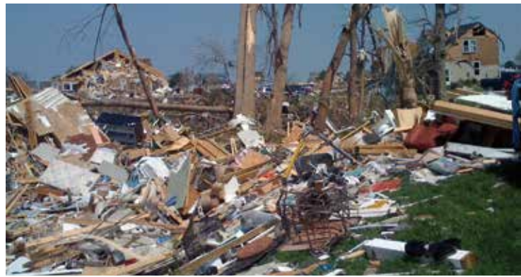
Tornado damage.

transportation, since workers' visa are tied to one employer. 16 If workers leave their jobs with that employer, they are often deportable. Employers, concerned about preserving as much crop as possible, may prefer that farmworkers work up until a storm hits or that they continue working as fires are spreading nearby leading to dangerous situations such as when farmworkers picking strawberries during the 2018 California wildfires continued working despite unsafe air quality. 17 Furthermore, local agencies may not view migrant farmworkers, in particular, as a part of their community and may fail to include them in their disaster planning or outreach. 18