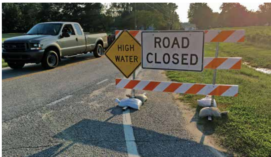
Many roads were closed post Florence due to flooding and washed out asphalt making transportation difficult, even dangerous.

in the aftermath of Florence. Staff at a few organizations in the affected eastern part of the state were overworked and left to coordinate not only their direct relief work, but the extra administrative tasks needed to coordinate donations, farmworker calls, and volunteers following a disaster. Organizations were inundated with calls from farmworkers, calls from willing volunteers or concerned citizens wondering how to plug into the relief and recovery effort, and calls from journalists reporting about how the hurricane was impacting farmworkers. The staff members who needed to be able to carry out the relief effort felt they lacked the capacity to manage both