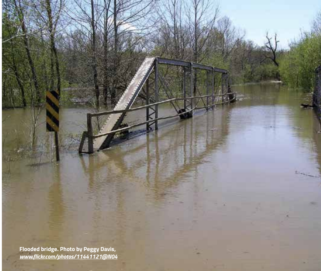
Flooded bridge.

These vulnerabilities impact both seasonal farmworkers, who work in agriculture but live in one community year-round, and migrant farmworkers, who travel from their permanent residence to work in agriculture and live in temporary housing. The NC Migrant Housing