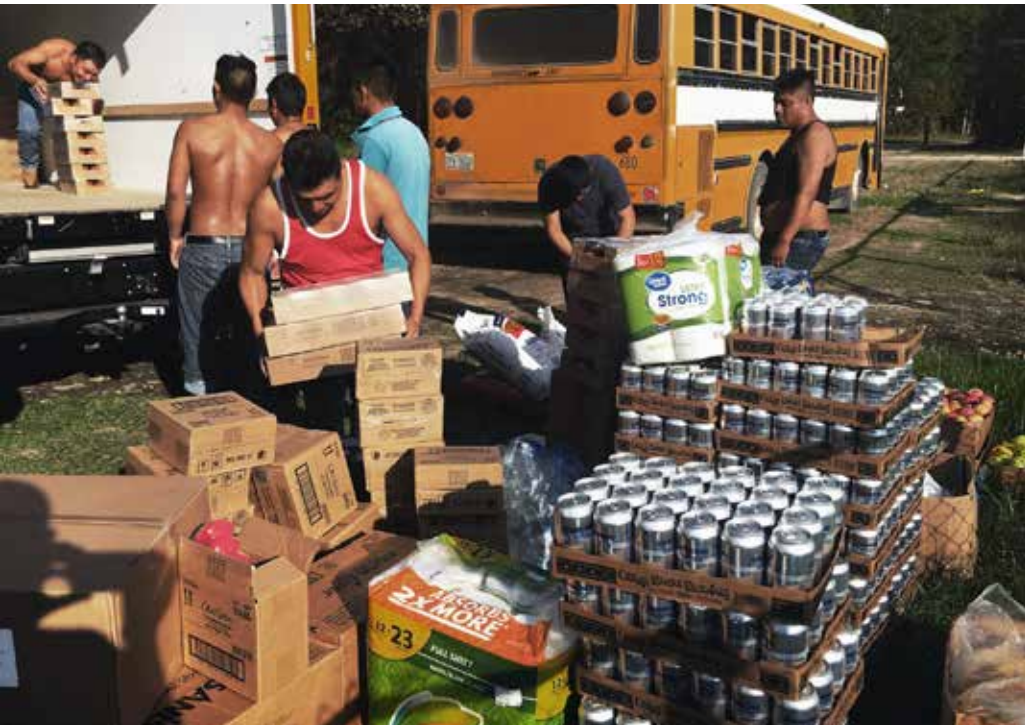
Workers unloading supplies at a camp after the hurricane.

Cross and Habitat for Humanity required education about engaging and providing services to migrant farmworkers. In many areas, emergency services were not aware of local labor camps in their service area or the challenges farmworkers face during evacuation. This was illustrated by the case of H-2A workers in Pollocksville, North Carolina, where a group of 35-40 H-2A workers became trapped in rising waist-deep floodwaters in their rural labor camp in Jones County, a county that had declared a state of emergency four days before the hurricane made landfall and had ordered mandatory evacuations. The workers were not aware of the evacuation order and their employer allegedly failed to alert them or evacuate them prior. Farmworker advocates, a federal agency, and a large grower association had to get involved when the employer allegedly told the dispatcher that the trapped workers were not in need of emergency help.