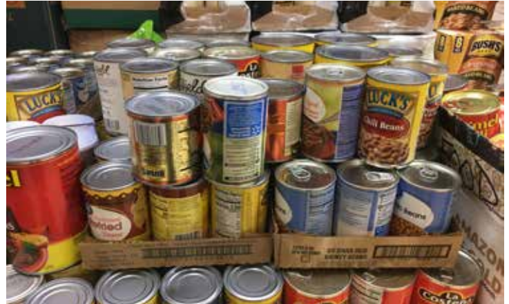
At the EFWM center, donations were dropped off, sorted and packaged so volunteers could distribute them. Many volunteers were needed to sort the donations into rations appropriate for different needs of families and camps.

disaster fair where farmworkers can address different legal or social service needs.