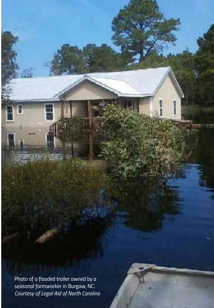
Photo of a flooded trailer owned by a seasonal farmworker in Burgaw, NC.