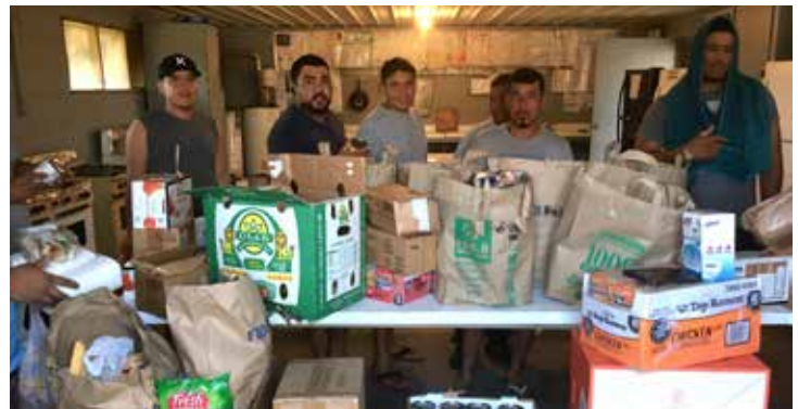
A group of farm workers with a few boxes of donations.

contact your local North Carolina partners including the Salvation Army Project FIGHT, World Relief High Point, and Legal Aid of North Carolina as soon as possible. If you are unable to reach someone, contact the National Human Trafficking Hotline at 1.888.3737.888.