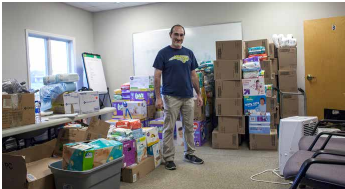
The Episcopal Farm Worker Ministry served as an important staging point during Hurricane Florence.

Along with distributing administrative tasks related to disaster relief among FAN member organizations, FAN needs a plan for handling press inquiries in a demanding time like during a disaster. This includes creating and sharing template resources before a disaster (such as the NC Farmworkers and Disasters Factsheet ) and deciding who should be responsible for responding to journalists. More broadly, developing